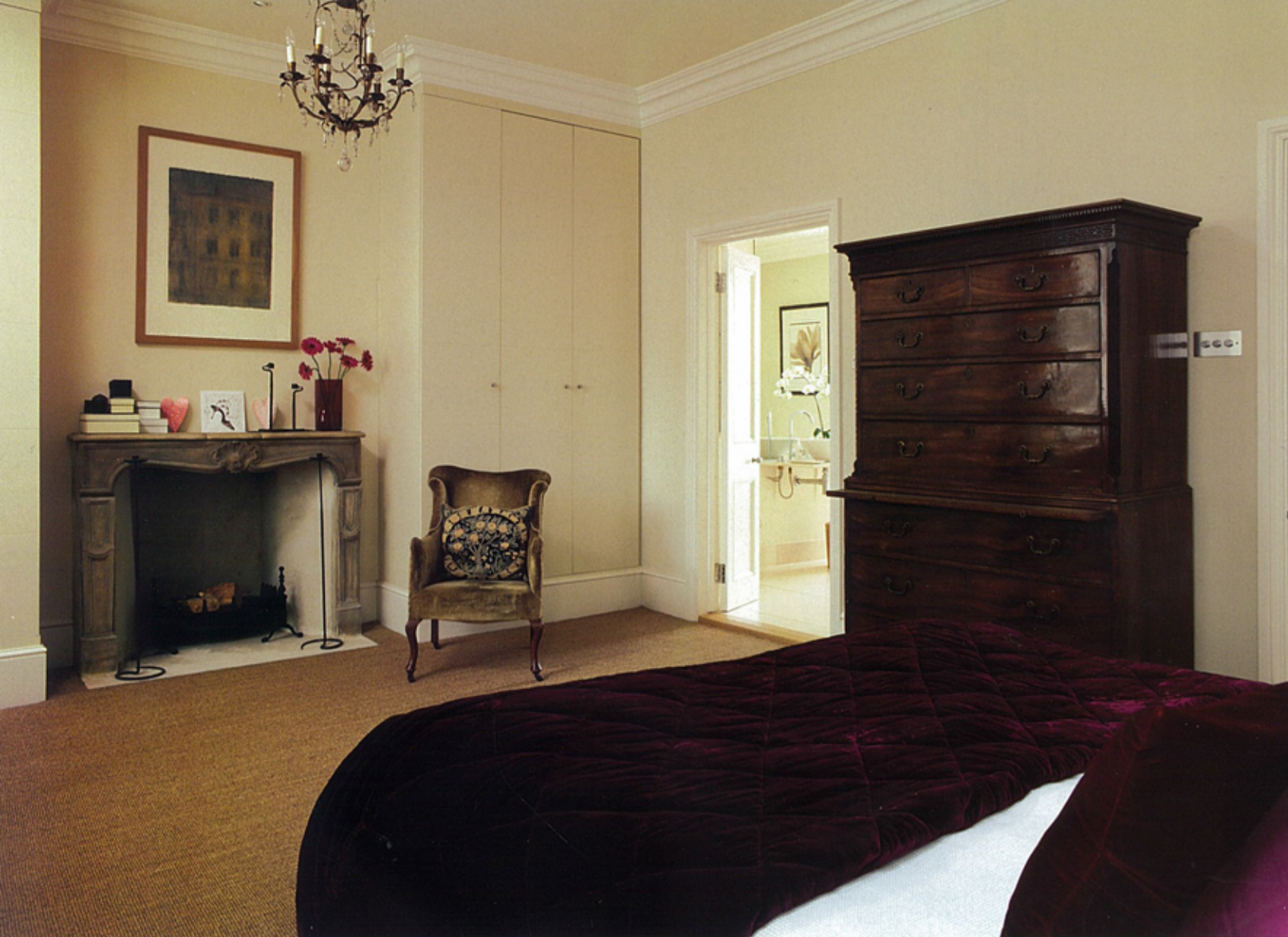
ABOVE The main bedroom, painted in Sanderson's Neutral Light, features more family heirlooms and a reclaimed French fireplace. Graham & Green's deep-plum throw on the bed adds richness and depth to the scheme. RIGHT Plain silk curtains have been edged with a deep-red velvet border to match the cushions, and Mandy found the contemporary bedside lamps at Laura Ashley.