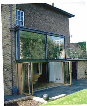
ABOVE This glazed room is filled with natural light and forges a strong link between the house and the garden.

Do not skimp on features that will make the space a joy to live in. Temperature control, especially in glass rooms, is key to comfort, while underfloor heating and good ventilation are crucial. ■