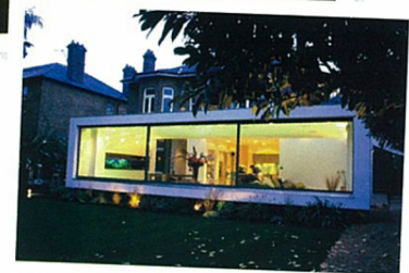
TOP Stunning floor-to-ceiling glass walls complement Victorian brickwork.